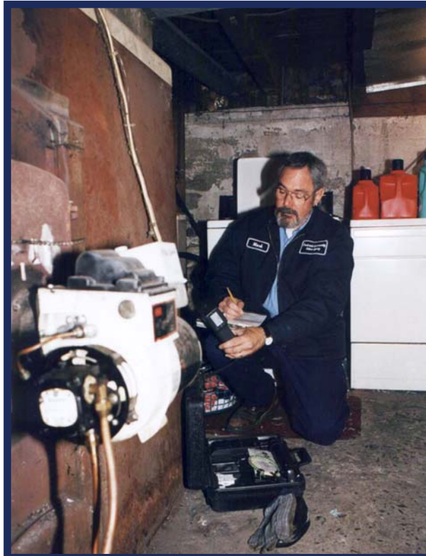
A technician conducts an efficiency analysis.

Our qualified crews repair and replace faulty windows and doors, install high-efficiency insulation, and, if necessary, repair or even replace boilers, furnaces, or water heaters. They replace air filters in your home to make the air your family breathes safer.